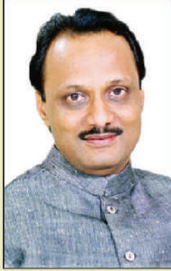
Hon. Mr. Ajit Pawar