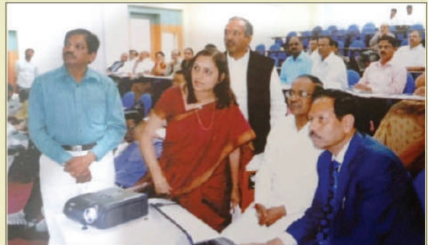
Inauguration of ARDB project by Vice Chancellor MUHS