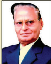
Hon. L.M. Pawar