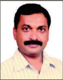
Hon. Rajendra Ghadge