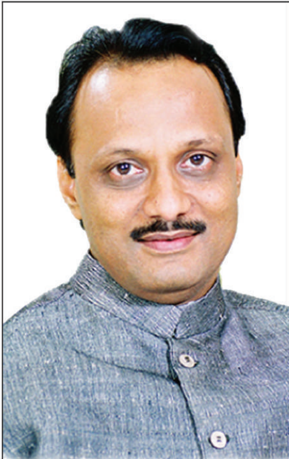
Hon. Mr. Ajit Pawar Dy. Chief Minister, Maharashtra State President-Pune District Education Association, Pune