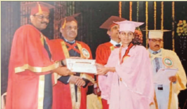
Honour of meritorious student by Vice Chancellor MUHS