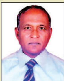
Hon. A.M. Jadhav