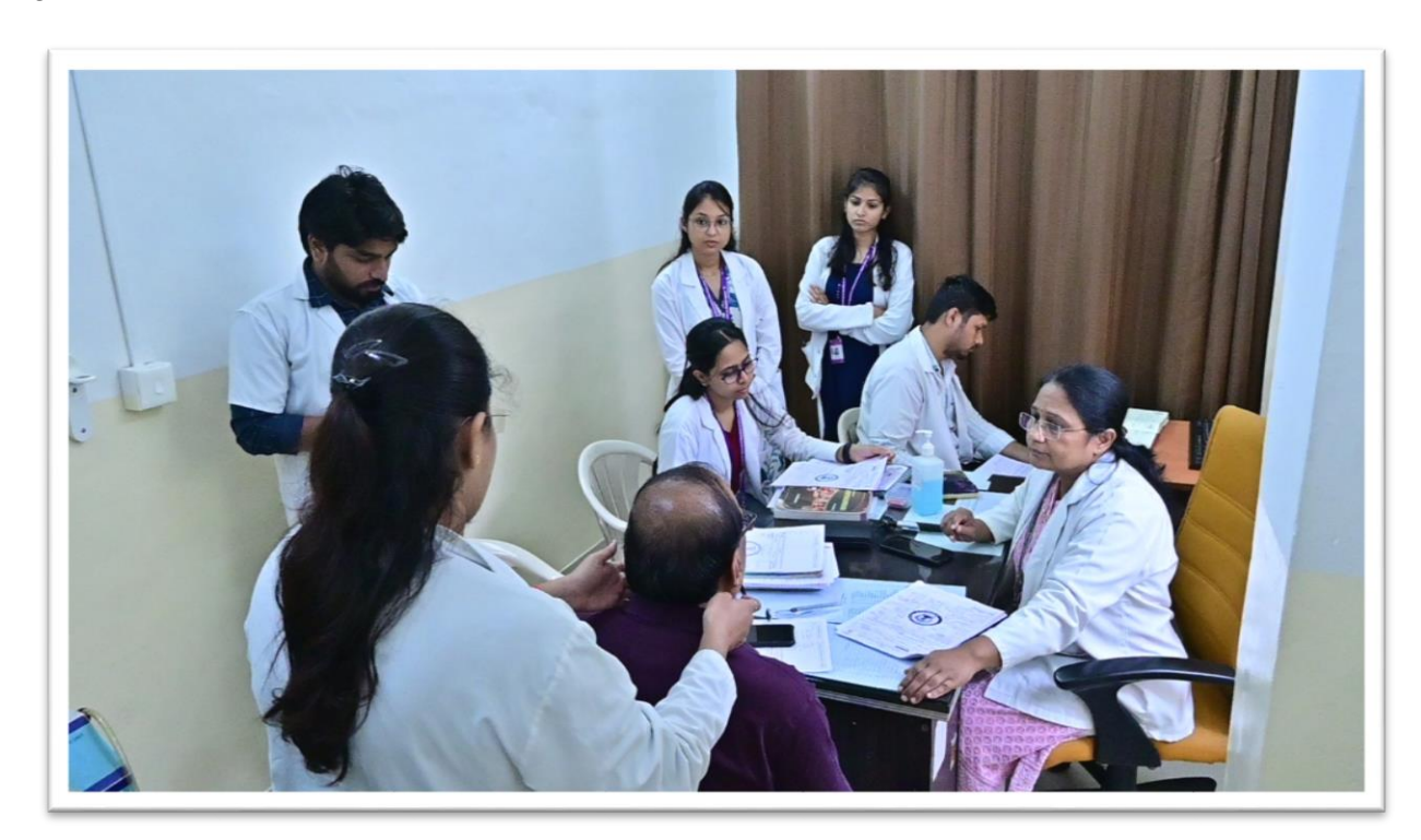
SHALAKYA - DANTA