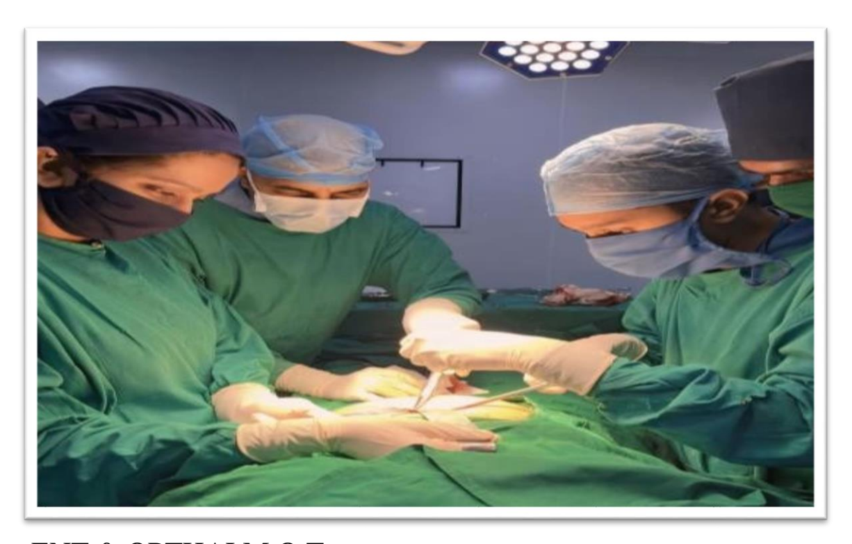
ENT & OPTHALM O.T