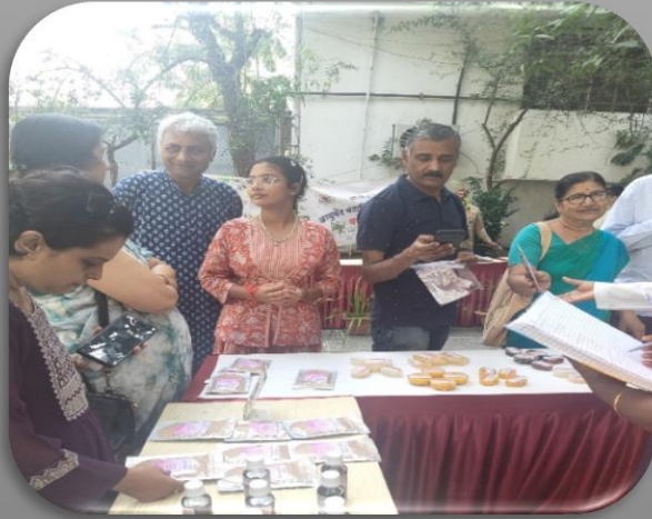
Ayurvedic medicine expo.