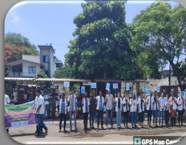
Rally on social issues