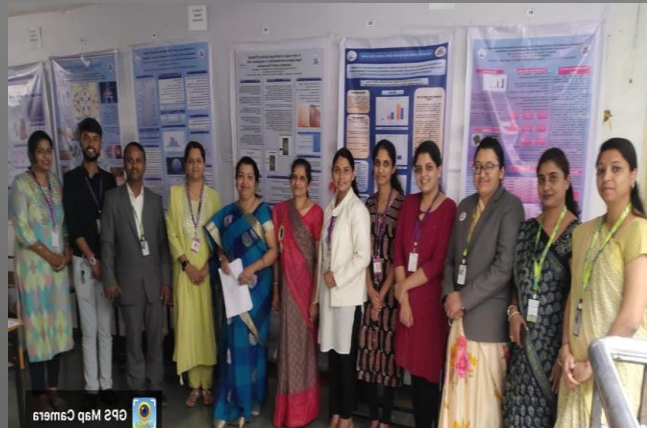
Participation and awards in P.D.E.A.'S Research competition