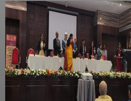
Awards for paper presentations to faculty