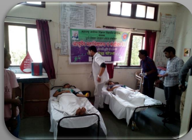
Blood donation camp