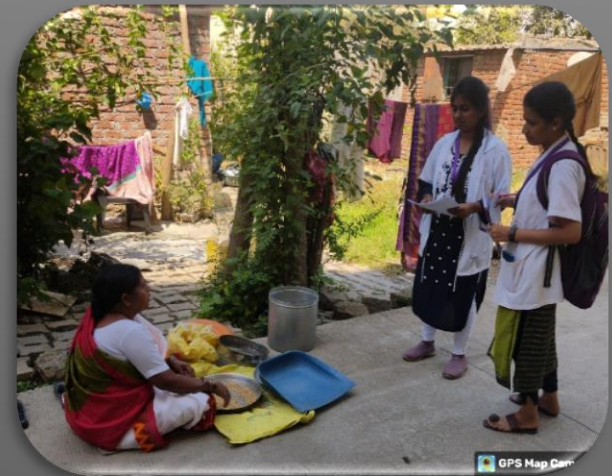
Door to door survey