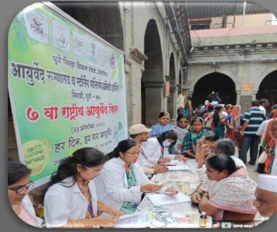
Medical health check-up camp