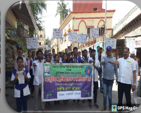
Voters awareness campaign