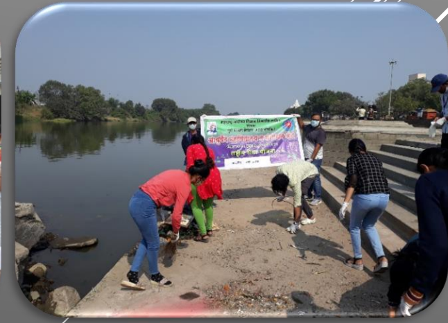
River bank cleaning camp