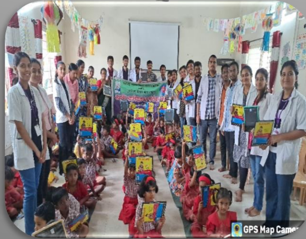
School health checkup camp