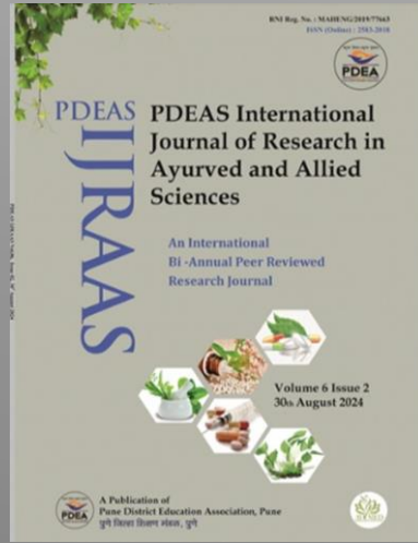
PDEA's IJRAAS journal of research