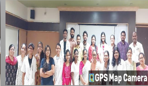
CSSS's certificate course in Research and Statistics- Grant Received from AYUSH