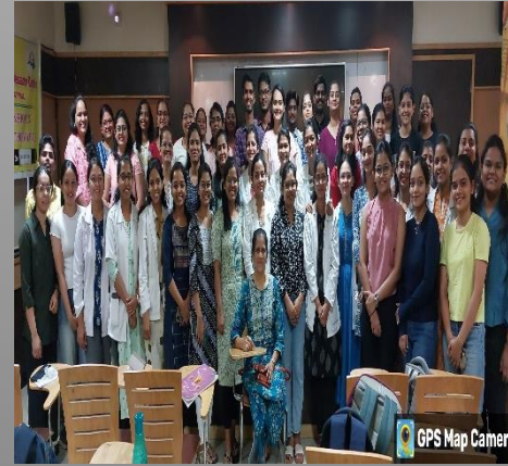
Basic and advance Research methodology workshop