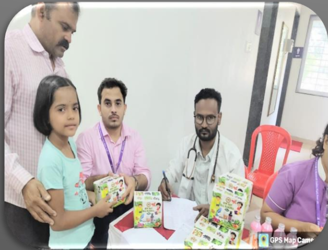
Bal-raksha kit distribution