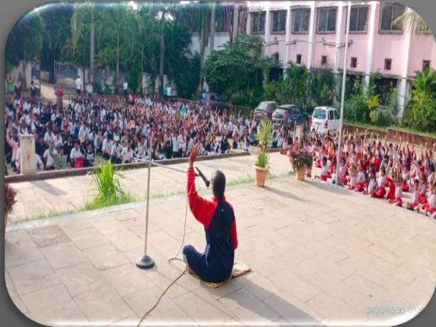
Outdoor yoga demonstration