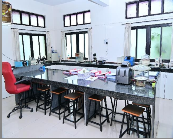
Institutional Research lab