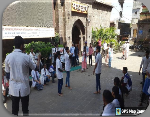
Road show on social issues